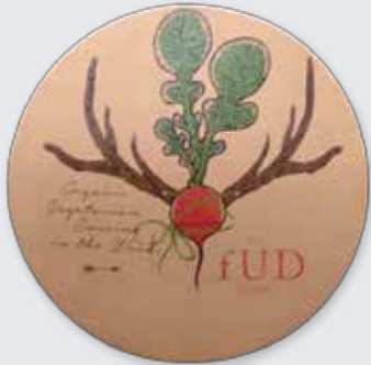
Produced with: TECHNI-PRINT® HS Paper